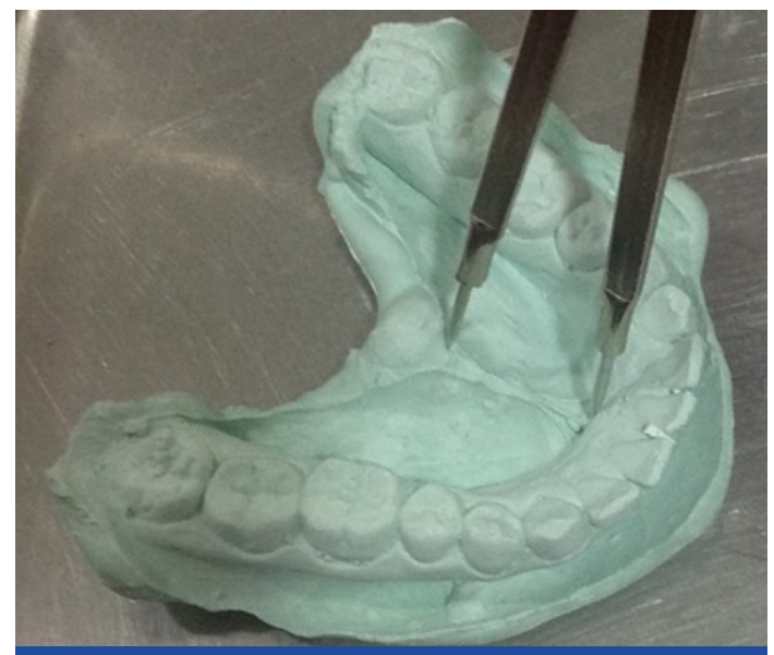
[Table/Fig-1]: Determination of Median lingual frenal length in a prediagnostic cast

The maximum mouth opening reduction was recorded in two steps. The patient was asked to open his/her mouth as wide as possible and the inter-incisal measurement (incisal margin of maxillary central incisor and mandibular central incisor) was determined. The patient was then requested to place the tip of tongue on the incisive papilla and the interincisal distance at this position was recorded again. The difference in the two values gave the reduced amount of maximum mouth opening [Table/Fig-2].